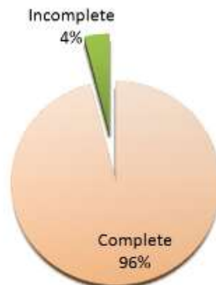
Figure 2. Distribution of final instruments used in the study

The purposive sampling method was used where the respondents were chosen for a certain purpose which in this study meant that the respondents a) are academic leaders and school administrators with management and leadership functions during the time of this study ; b) faculty with leadership positions in the undergraduate, graduate programs, academy and elementary departments; c) are affiliated with the institution and willing to be involved in the study. For the respondent schools, the criteria that were used were as follows: a) the respondent must be a Seventh-day Adventist tertiary institution in Asia, and b) the population of school administrators must be considered.